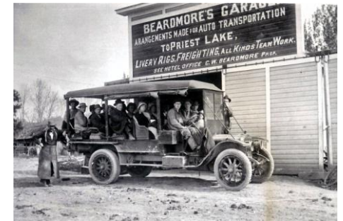
BEARDMORE AUTO STAGE