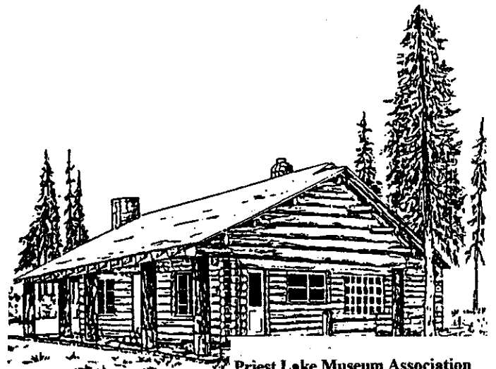
Priest Lake Museum Association Box 44 • Coolin, Idaho 83821-0044