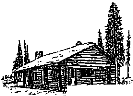
Priest Lake Museum Association Box 44 • Coolin, Idaho 83821-0044