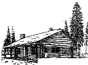
Priest Lake Museum Association Box 44 ♦ Coolin, Idaho 83821-0044

The Priest Lake region is rich in history and there are many areas of interest we hope to include and develop as time, energy and money becomes available.